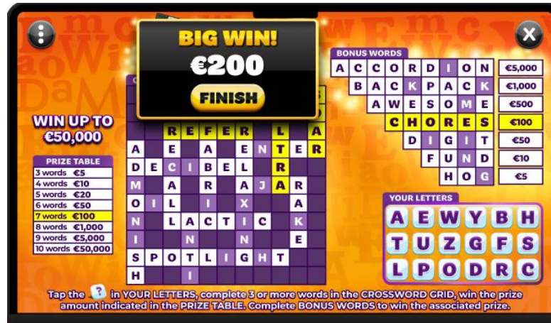
Please see above an example of an end winning play